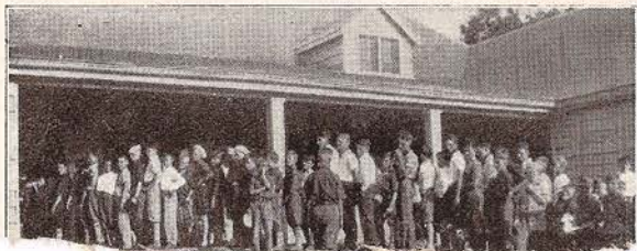
Lined Up for "Mess"

Campers at Fort Scott are invited to become members of The Big Store Co. Schoolmate Club, Seventh and Race. A live club that every boy enjoys. Membership FREE.