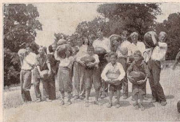
Happy Gang at Camp

N. W. Corner Seventh and Main Streets, Cincinnati, Ohio