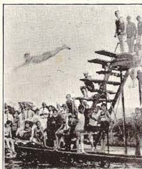
Time for a Swim at Fort Scott Pool

The men who will have charge of your boys at Fort Scott know how to play with the boys, yet discipline them kindly. They are greatly concerned in the physical, mental and moral welfare of each boy.